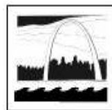
MCU for St. Louis

leaders or just by ordinary people. That is the message of our successful Alpha program. Each day in so many ways, we all can be evangelizers for Christ! Try it. Here are some ways: make a new friend, offer a hug, call a lonely person, read to a child, give a compliment, respect others, lend a hand, celebrate the day, forgive mistakes, share a smile... Do one kind act each day, and share in spreading the good news